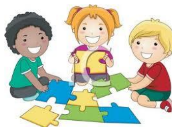
Jigsaws & Games