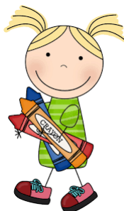
Colouring & Drawing